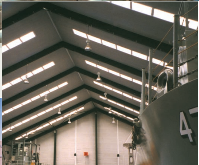
H.M.A.S. Cerberus training facility - Victoria