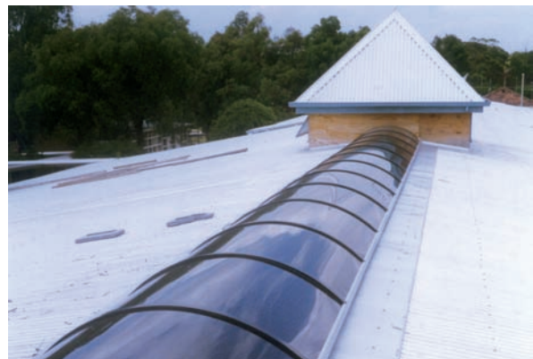
Laburnum Primary School; continuous tinted 90 x 1 metre LongLite.