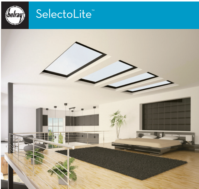
SelectoLite™ is a state of the art innovation that offers diffused solar energy and high light transmission all year round. Ideally suited for hospitals, schools and offices where reduction of solar heat and glare are important.