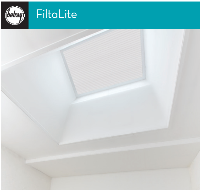
FiltaLite provides year round radiant sun and heat control by minimizing radiant heat in summer and maximizing light transmission in winter.