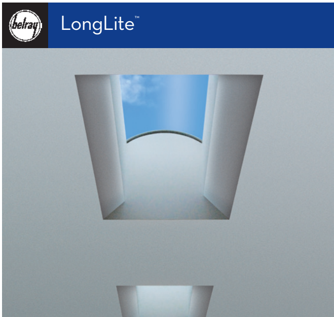
LongLite™ are linear skylights designed for use as a single module or a continuous run. They are ideally suited to stadium and warehouse applications.