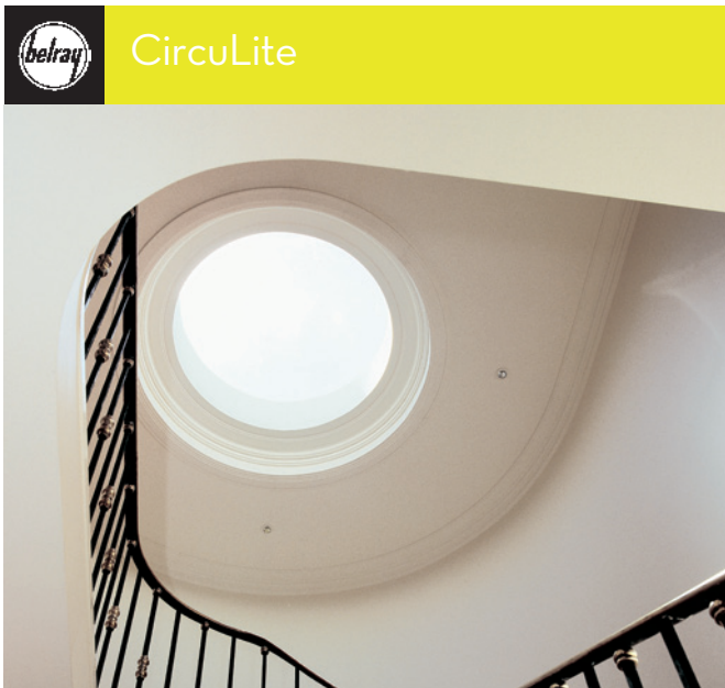
CircuLite provides a stunning aesthetic feature to any room, entrance, or landing with all of the environmental and energy saving benefits of natural daylight harvesting.