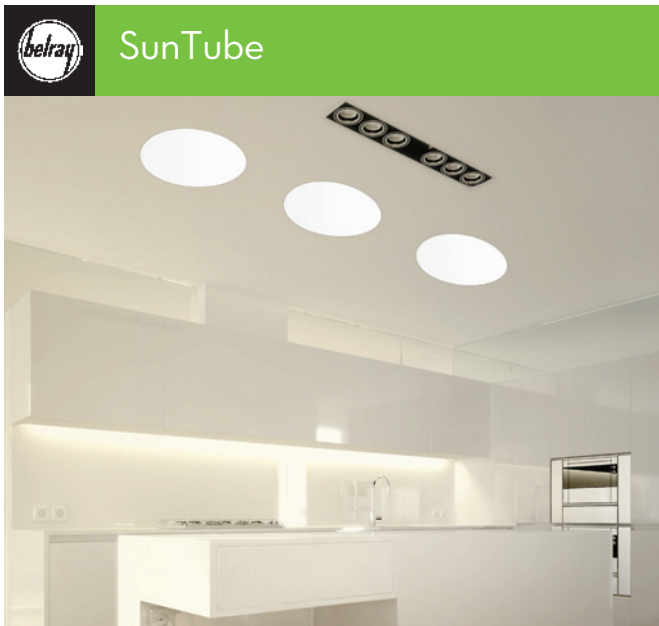
SunTube skylights are designed for minimal structural alterations in both residential and commercial applications.