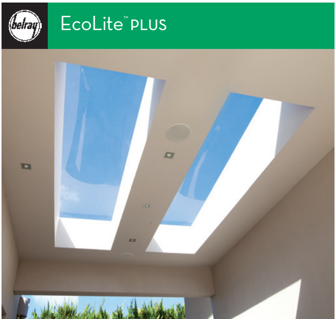
The EcoLite™ PLUS insulated glass unit (IGU) is a revolutionary second generation double glazed glass skylight which exhibits extremely high light transmission with very low solar heat gain.

For further information please visit our showroom demonstrating over 90 skylights and displays, or contact us at info@belleskylights.com.au