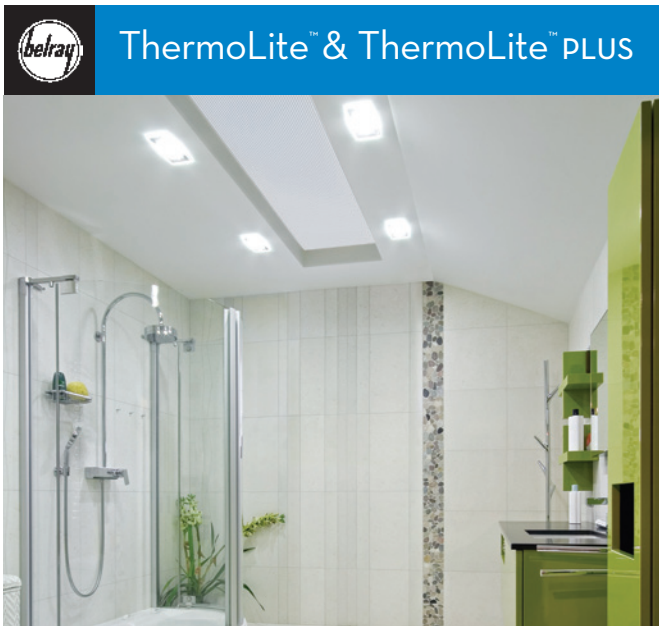
ThermoLite™ provide quality, durability and high light transmission all year round, providing an economic alternative for commercial applications.