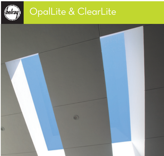
OpalLite and ClearLite provide an economic alternative for domestic and commercial applications.